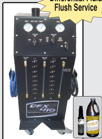
Differential Fluid Flush Service