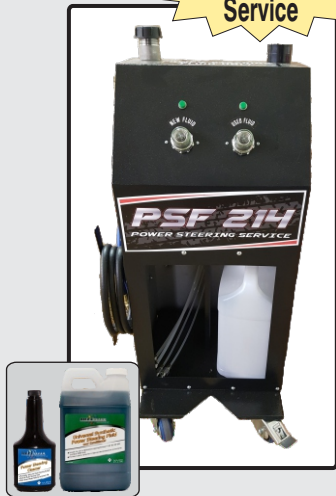
Power Steering Fluid Exchange Service