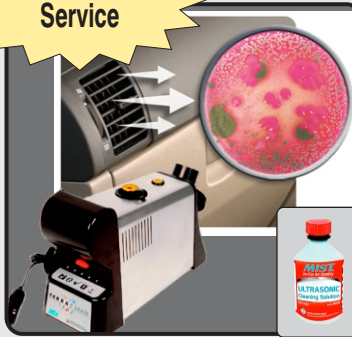
In-Car Air Service