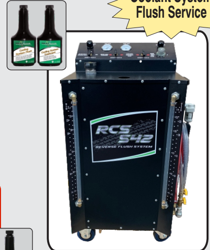
Coolant System Flush Service