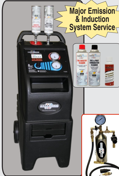
Major Emission & Induction System Service