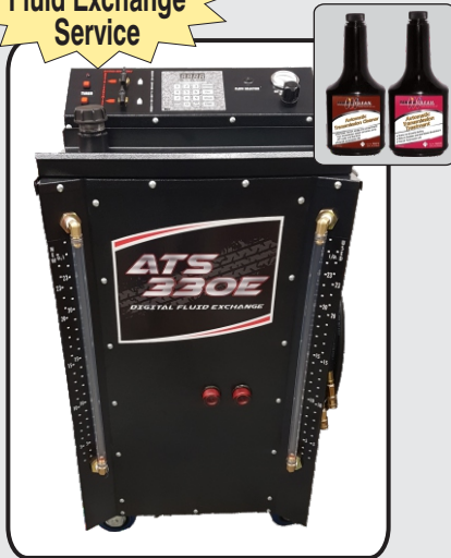
Transmission Fluid Exchange Service