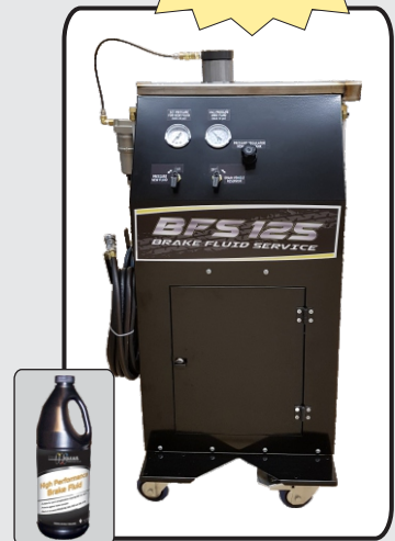
Brake Fluid Flush Service